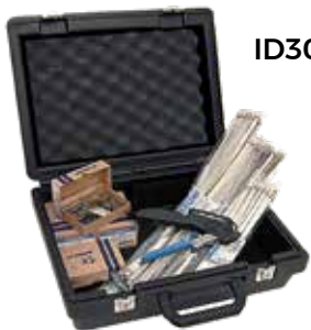
ID3009 ID Kit