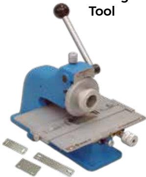
ID Tag Imprinter Tool