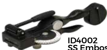
ID4002 SS Embossing System